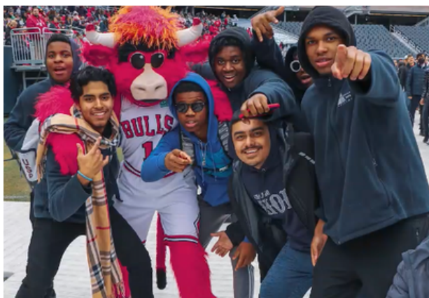
Hope football and basketball players pose for a picture with Bennie the Bull after cheering for SOC athletes.